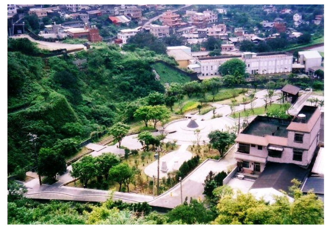
The Taiwan POW Memorial Park, Phase I - constructed in 2005 by the Taipei County Gov't. It contains the original POW Memorial, the Eternal Flame of Peace and Remembrance and the POW Memorial Tree.

was dedicated on November 20<sup>th</sup> of that year. The following year the Society erected the Eternal Flame of Peace and Remembrance Sculpture and in 2007 the Taiwan POW Tree - a living memorial to the POWs, was dedicated.