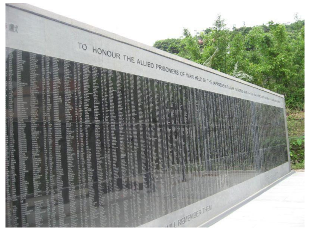
The Taiwan POW Memorial Wall – awesome!