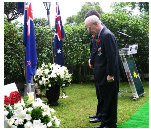
Society Director laying a wreath on ANZAC Day

For the ninth time in as many years, the Society participated with our Australian and New Zealand friends to celebrate ANZAC Day here in Taiwan. There were 55 Australian POWs on Taiwan - three of whom died. There was only one New Zealand POW – an officer in the RNZAF, who was held in the officers' camp before later going to Manchuria.