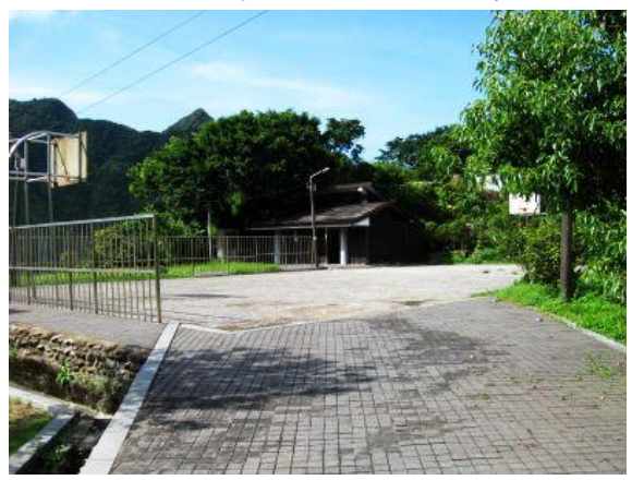
Area of the old unused basketball court at the back of the park before the construction of Phase II

The plan was to build a 56 foot (17 m) polished black granite memorial wall similar to the Vietnam Wall in Washington DC, with the names of all the Taiwan POWs engraved on it. Near the wall there would be a meditation square with gardens and benches where visitors could sit and relax and reflect on the lives and the sacrifices of the POWs. The area would contain an information board telling the story of all 16 camps so people could learn about all the POW camps in Taiwan, not only Kinkaseki.