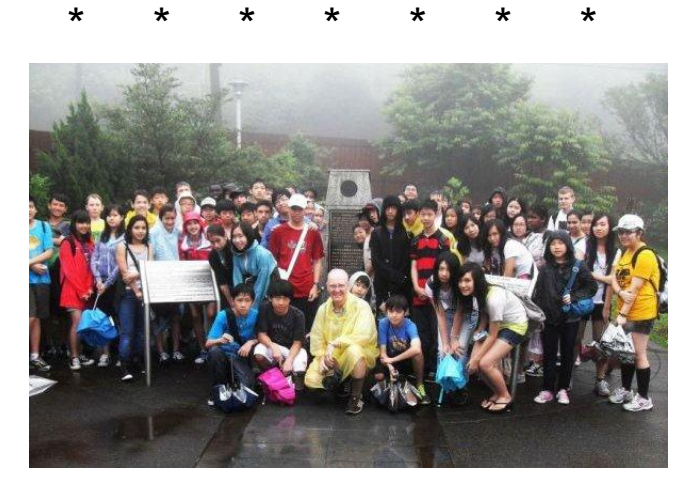
TES Students by the Taiwan POW Memorial

Following the service a time of fellowship was had over lunch at a nearby restaurant and everyone agreed that it was a worthwhile and meaningful event. We plan to make this an annual Society event and next year it will be organized and announced sooner. Our thanks to those who took part, and hopefully next year we'll have a much bigger gathering.