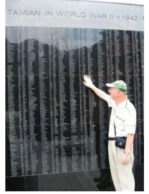
(left) Views of the wall looking both ways. (Above) Please come and experience the "spirit of the wall" for yourself !