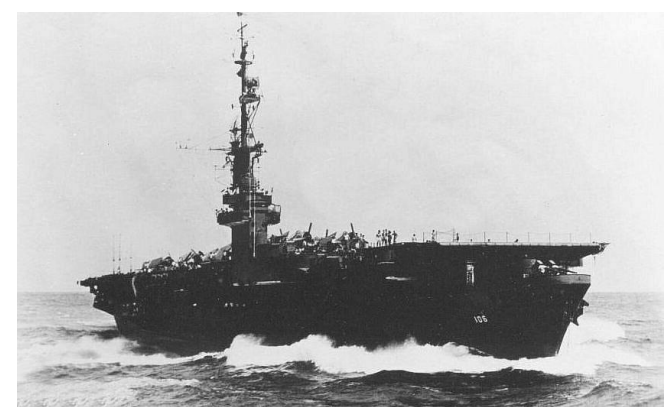
The USS Block Island off Taiwan in 1945

The USS Block Island CVE-106 was one of the two US Navy aircraft carriers and four destroyer escorts that helped to evacuate the Taiwan POWs from Keelung Harbour and transport them to Manila following the Japanese surrender in September 1945. The former crew-members have a wonderful association which helps them to keep in touch and every year they have a reunion to remember former times and comrades. In 2007 I was honoured and privileged to be able to attend the reunion in Providence RI, USA (See article in the Spring-Summer 2007 newsletter).