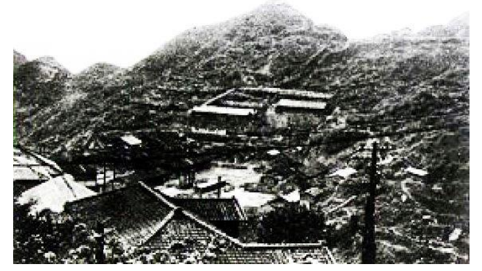
The former Kinkaseki POW Camp during WW II

That this year is the 15<sup>th</sup> Anniversary of the start of the movement to learn about the former Japanese Prisoner of War camps on Taiwan during World War II is a milestone in itself.