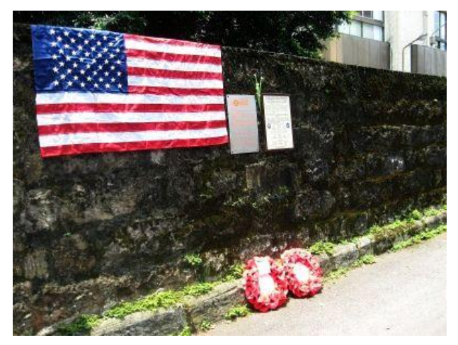
Wreaths by the old prison wall on Memorial Day

This year, in response to a query from one of our new American members living in Taipei as to whether anything was being done here on Memorial Day, we decided to organize the first ever Memorial Day service put on by our Society.