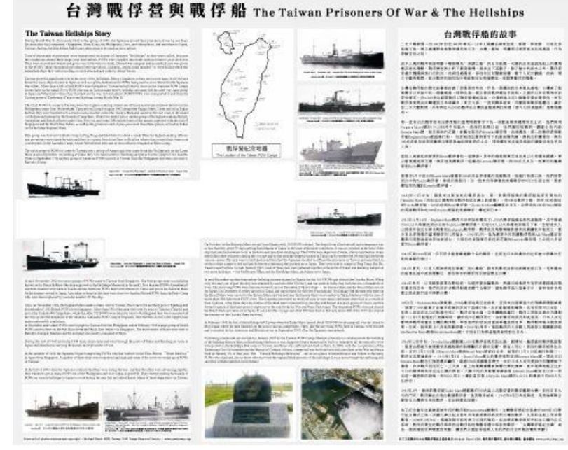
Photo of the Taiwan POW Hellships wall display in the War & Peace Park Museum in Kaohsiung

I encourage our friends here in Taiwan to visit the War and Peace Park and museum if you have the chance. The site of the memorial park is north of Chijin Windmill Park (旗津風車公園北邊) at No. 990, Chijin 3<sup>rd</sup> Rd. (旗津三路 990 號 ).