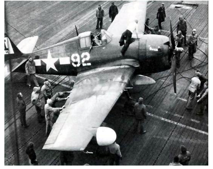
F6F Hellcat on Block Island wooden deck – April 1945

deck planking was removed and replaced, and the original planking was put in storage at the US Naval Historical Center at the Washington Navy Yard.